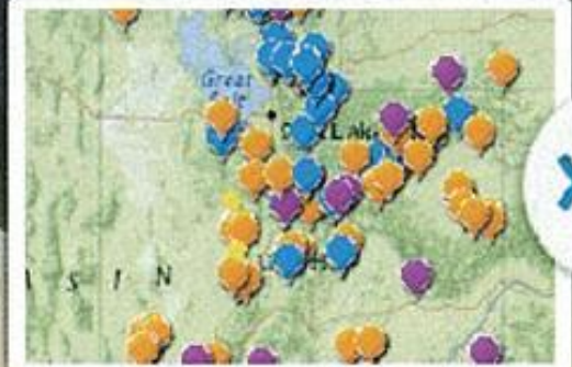
Explore Walk-In Access Areas