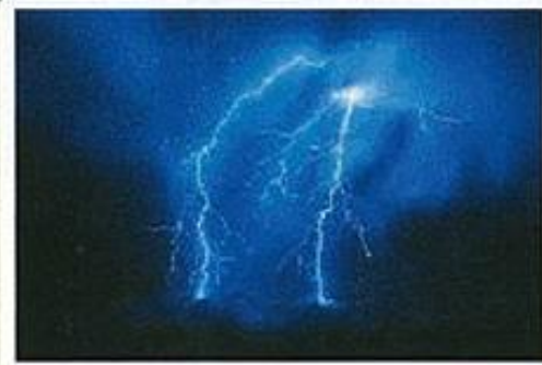
2013 Wildland Fires