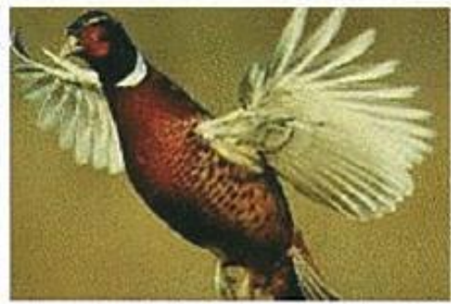
2013 Utah Pheasant Release Areas