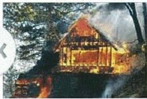
2013 Communities at Risk to Wildland Fire

A collaborative information site and mapping platform brought to you by the Utah Department of Natural Resources